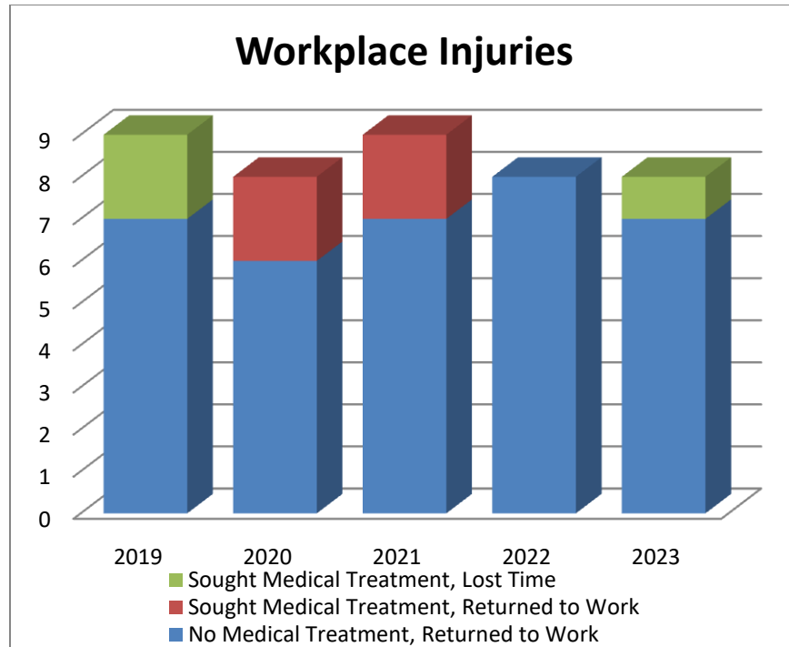
Figure 1: Distribution of incurred workplace injuries between 2019-2023. Medical Treatment is defined as requiring a trip to the doctor or hospital. 'No Medical Treatment' may have required the use of the Best Theratronics' first aid kit.

In all instances, medical reports were reviewed and corrective actions were introduced if appropriate. Workplace injuries and lost time incidences are reviewed on a monthly basis by the Health and Safety Committee to ensure effort is put forth to prevent future occurrences.