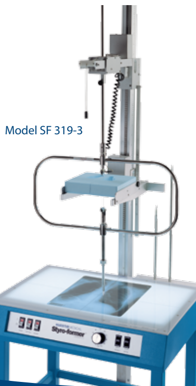
Model SF 319-3