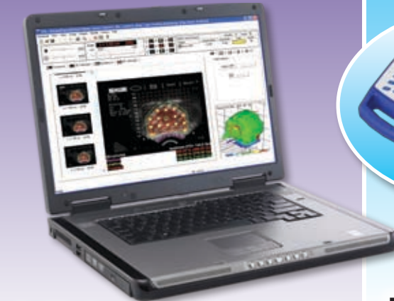
Best Treatment Planning Systems for LDR, HDR Brachytherapy, SRS, SBRT, Tomotherapy and Teletherapy with ActiveRx for IMRT