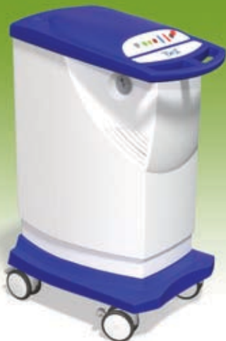
Best HDR Remote Afterloader

The new Avanza 6D table provides adjustment in all 6 dimensions, including pitch and roll. This option will greatly improve the patient set-up for all treatments.