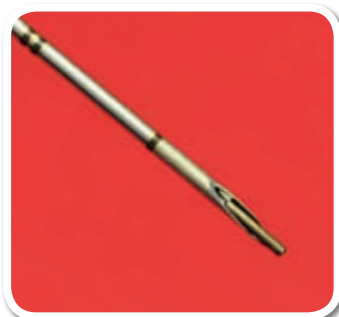
Loose Seed Loaded into Localization Needle