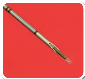
Seed in Tissue-Absorbable Strand Material

We ship your order within 24 hours Sterile and Non-Sterile