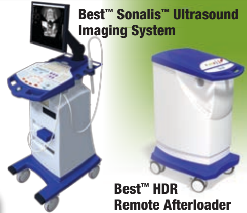
Best™ HDR Remote Afterloader

Best Medical is the only company that makes custom seeds & strands to your exact specifications — shipped within 24 hours, 7 days a week, sterile & non-sterile!