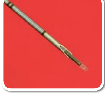
Seed in Tissue-Absorbable Strand Material