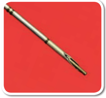
Loose Seed Loaded into Localization Needle