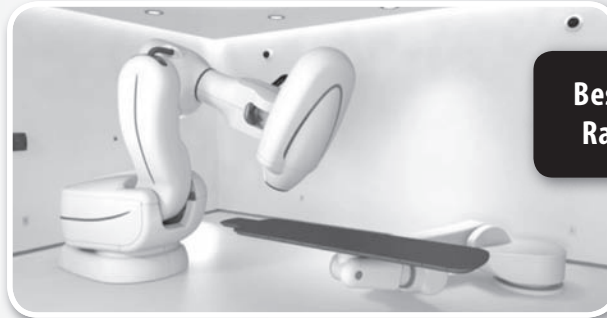
Best™ X-Beam™ Robotic Radiosurgery System