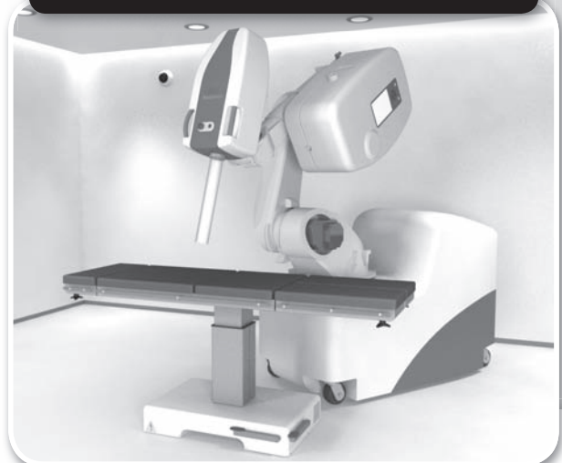
Best™ E-Beam™ Robotic IORT Linac System