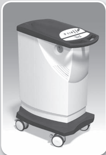
Best™ HDR Afterloader