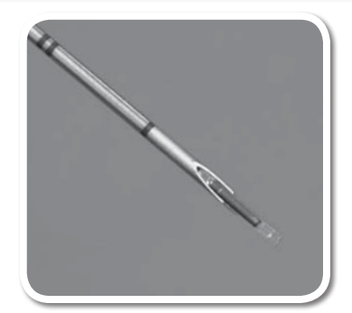
Seed in Tissue-Absorbable Strand Material

We ship your order within Sterile and Non-Sterile