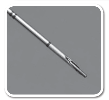
Loose Seed Loaded into Localization Needle