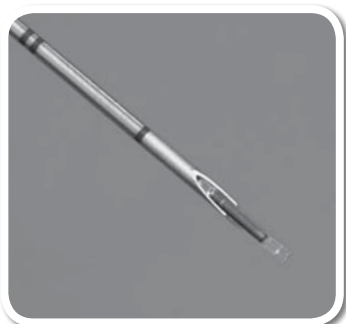
Seed in Tissue-Absorbable Strand Material

We ship your order within 24 hours Sterile and Non-Sterile