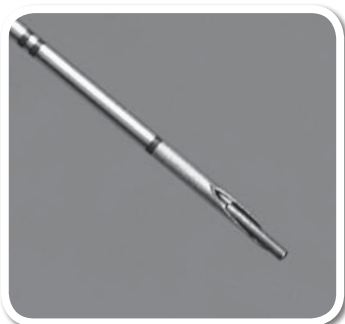
Loose Seed Loaded into Localization Needle