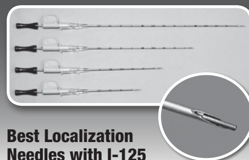
Best Localization Needles with I-125 Seeds (Loose & Stranded)

Best Medical International, Inc. 7643 Fullerton Road, Springfield, VA 22153 USA tel: 703 451 2378 800 336 4970 www.besttotalsolutions.com www.teambest.com