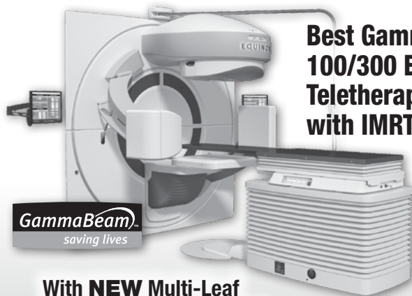
Best GammaBeam TM 100/300 Equinox Teletherapy System with IMRT & IGRT

With NEW Multi-Leaf Collimator for 80 and 100 cm SAD units — IMRT, IGRT, SRS, SBRT and Tomotherapy capable with ActiveRx