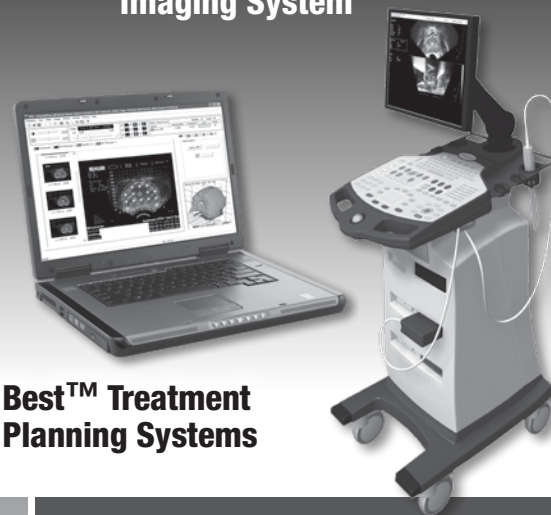
Best TM Treatment Planning Systems