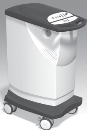
Best TM HDR Remote Afterloader

The new Avanza 6D table provides adjustment in all 6 dimensions, including pitch and roll. This option will greatly improve the patient set-up for all treatments.