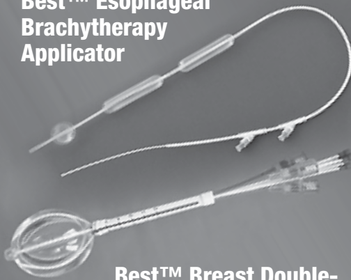
Best TM Breast Double- Balloon Brachytherapy Applicator