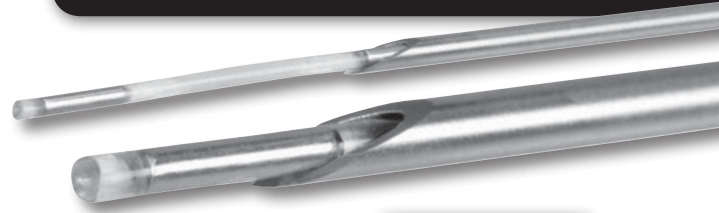
Best™ Fiducial Markers