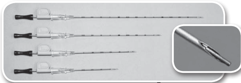
Best™ Localization Needles with I-125 Seeds

Best™ Seeds have the best visualization in ultrasound, fluoro, x-ray, CT and MRI, facilitating real-time dosimetry!