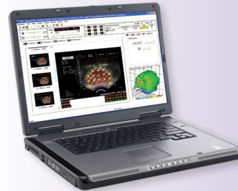
Best™ Treatment Planning System