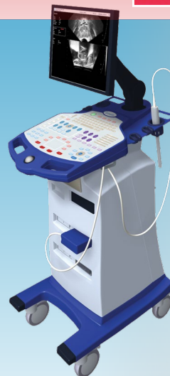
Best™ Sonalis® Ultrasound Imaging System