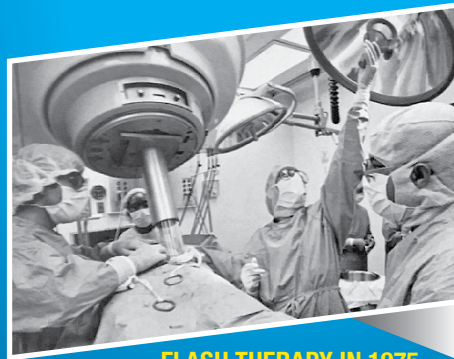
FLASH THERAPY IN 1975

TeamBest Global Companies plan to introduce a new version of the IORT System/Flash Therapy, utilizing a robot. It's noteworthy that this is the first time a robot has been used, and Best Medical International holds a patent for this Robotic Electron Linac.