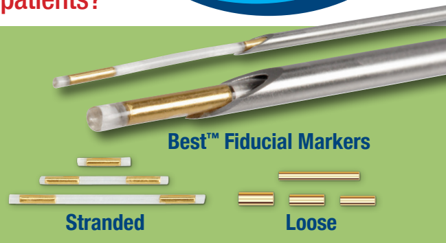
Best™ Fiducial Markers