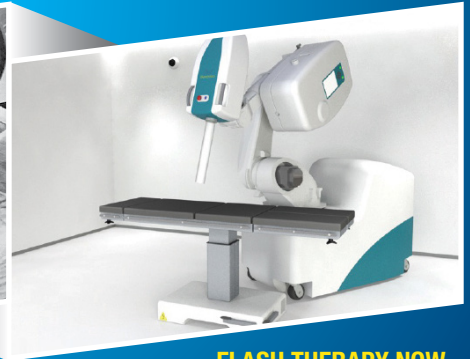
FLASH THERAPY NOW

Please visit www.teambest.com to find out more.