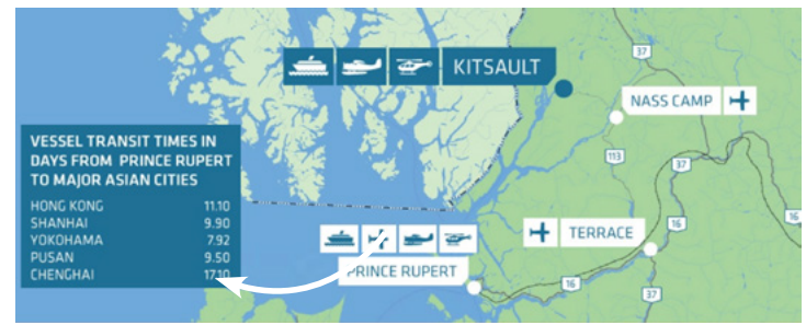
Vessel Transit Times

Suthanthiran is leading the KE project with a bold vision: to supply crude oil and natural gas in the form of liquid butanol to India through dual pipelines extending to the west coast of British Columbia, near Kitsault and Observatory Inlet (Spectra Energy/Enbridge already has two pipeline routes to the region, approved by the former National Energy Board of Canada). The plan includes establishing a floating butanol manufacturing facility at Observatory Inlet, a dedicated energy export port and terminal, and transporting crude oil and natural gas to produce and export liquid butanol—a cleaner-burning fuel with broad applications. Butanol offers advantages over LNG in cost, distribution, and port receipt, without requiring multi-billion-dollar infrastructure investments.