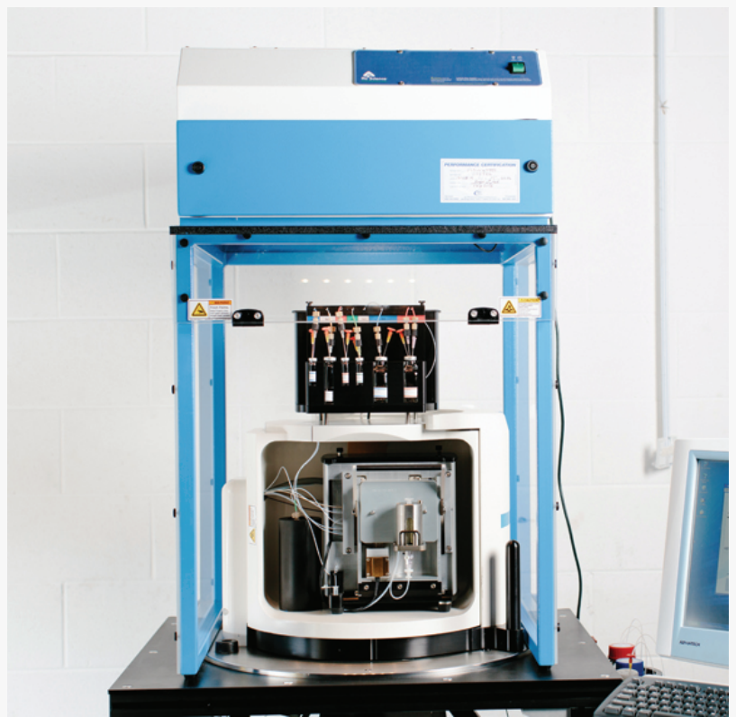
Best Chemistry Module