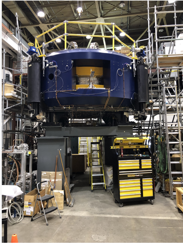
Best 70 MeV Cyclotron Magnet Assembly

In early 2019, PPS responded saying that they will not amend the contract, cancelled the order,