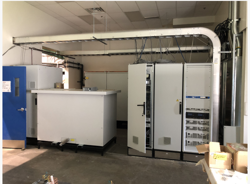
Best 70 MeV Cyclotron Cabinets